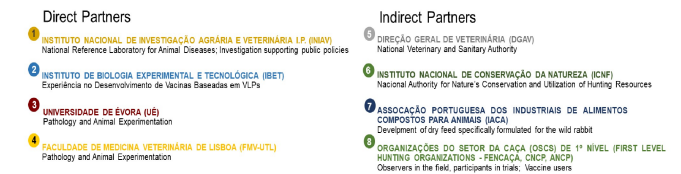
Figure 2. Project Fighth-two partnership.